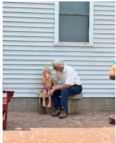
Hanging with grandpa!