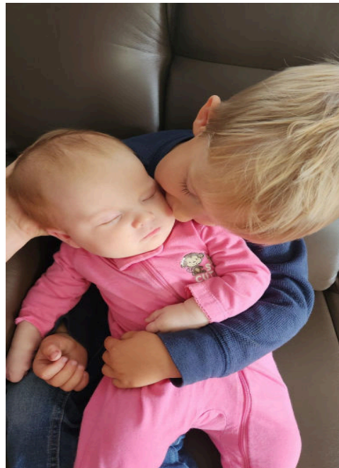
New cousin lovin