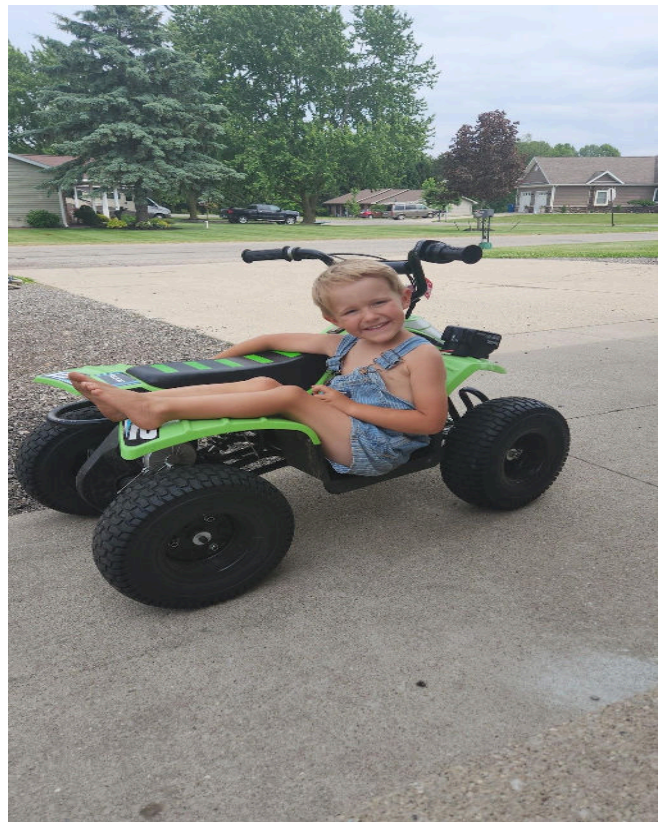
Doing what he loves!