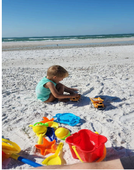
Siesta Key, our favorite beach!