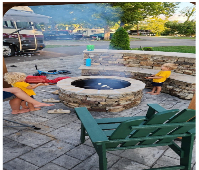
S'mores in Gatlinburg