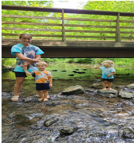
Favorite camping spot