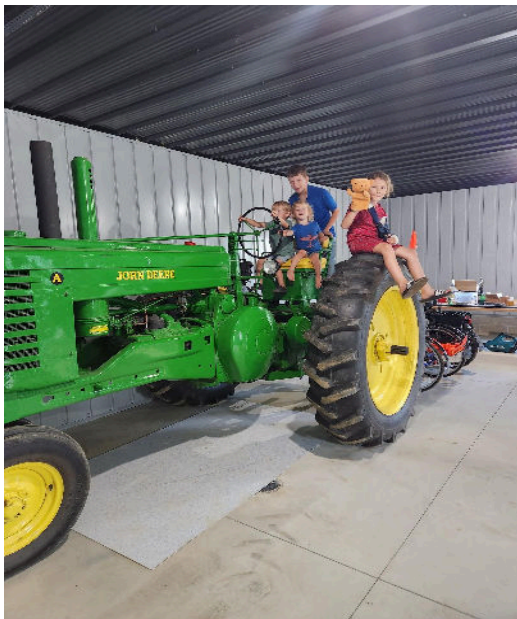
Cousins on grandpa's tractor

Your child has 2 families that are over the moon excited to love him or her! Both our families live close by and we get together often to share meals. We have park days with cousins and water slide fun at grandma and grandpa! We are also surrounded by an amazing and supportive church family that will love your child as their own!