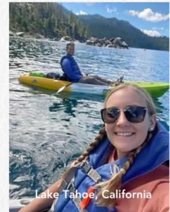
Lake Tahoe, California

We can't wait to get to share many more travel experiences with our future children!