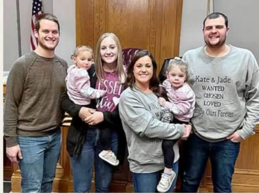
OUR TWIN NIECES' ADOPTION DAY!

We will respect the child's background, and do our very best to help them understand and appreciate thier heritage.