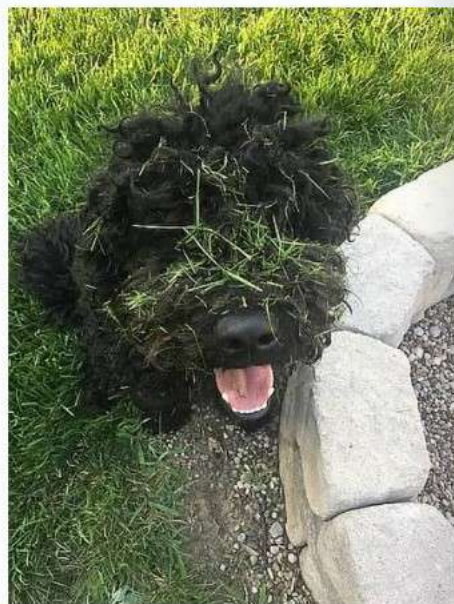
STANLEY - 4