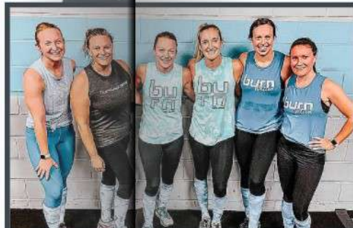
FITNESS + MOM FRIENDS