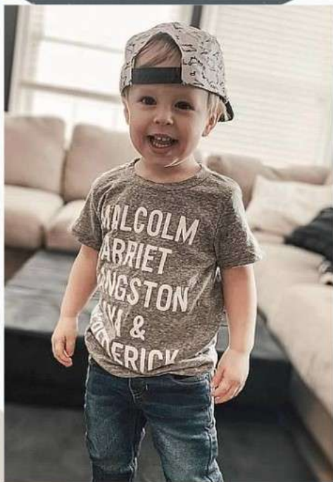
GRIFFIN - 2