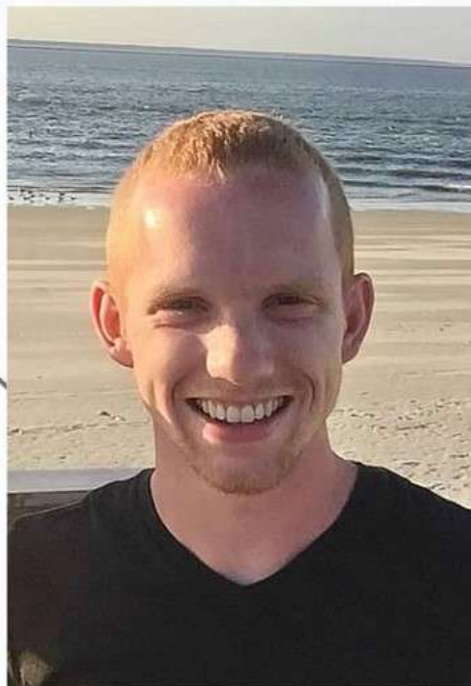
ADDISON - 31