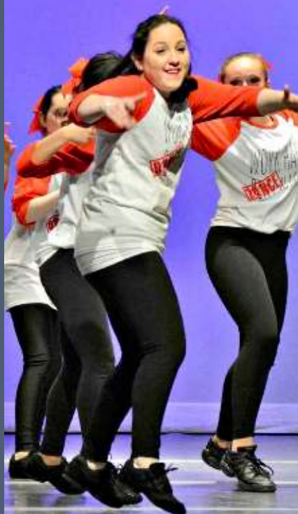
DANCING IN A SCHOOL RECITAL