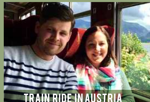
TRAIN RIDE IN AUSTRIA