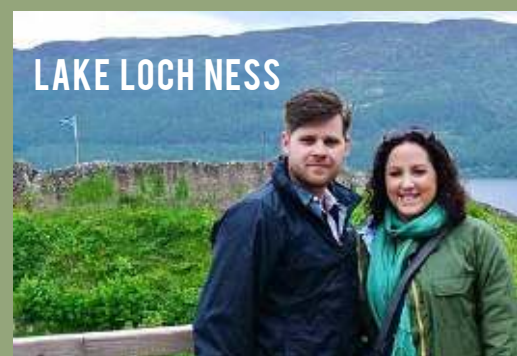
LAKE LOCH NESS