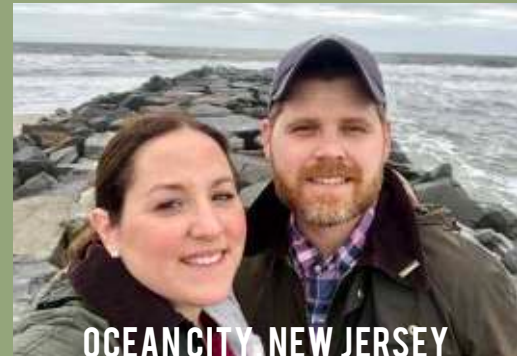
OCEAN CITY, NEW JERSEY