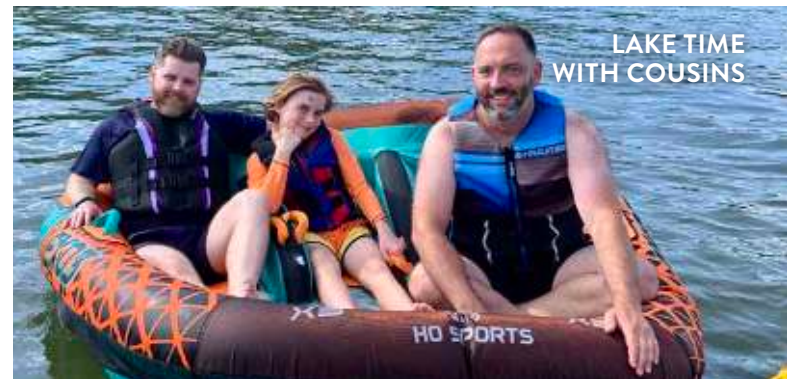
LAKE TIME WITH COUSINS