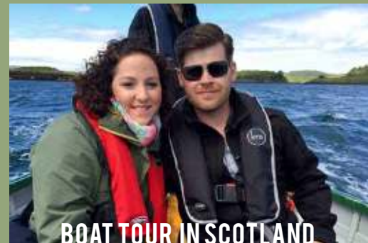
BOAT TOUR IN SCOTLAND