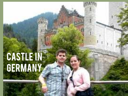
CASTLE IN GERMANY