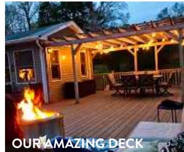
OUR AMAZING DECK