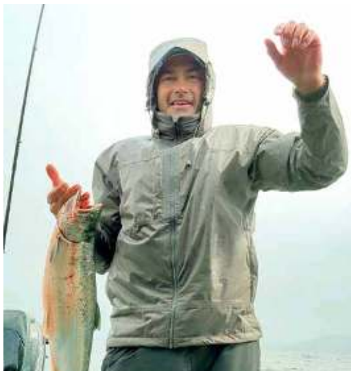
FISHING IN ALASKA