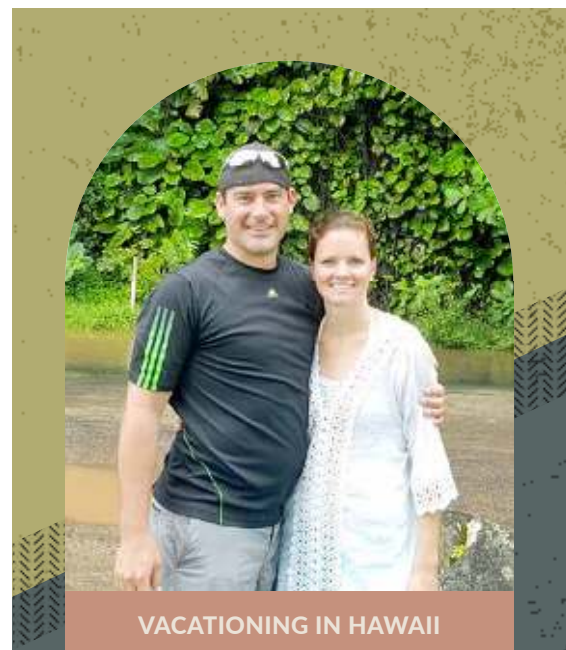
VACATIONING IN HAWAII