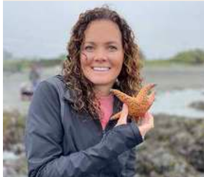
I FOUND A STAR FISH!