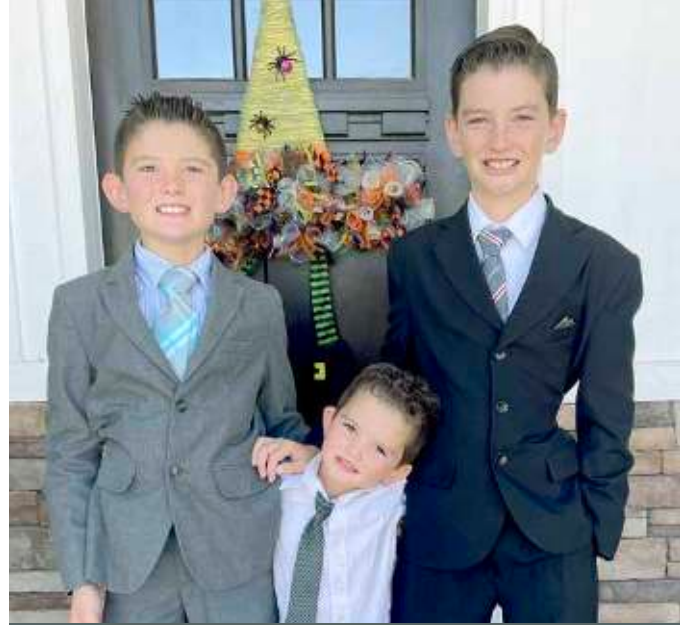
DRESSED IN OUR SUNDAY BEST!

is 4 and is biological. He has been such a joy to our family. He is always keeping everyone laughing and smiling. He is a busy boy and is always on the go! He wants to do everything his big brothers do and loves playing with them. He is so excited to have a baby sister and prays for her often! He has even made a bed for her on our floor and won't let anyone move it, because it is his baby sister's bed.