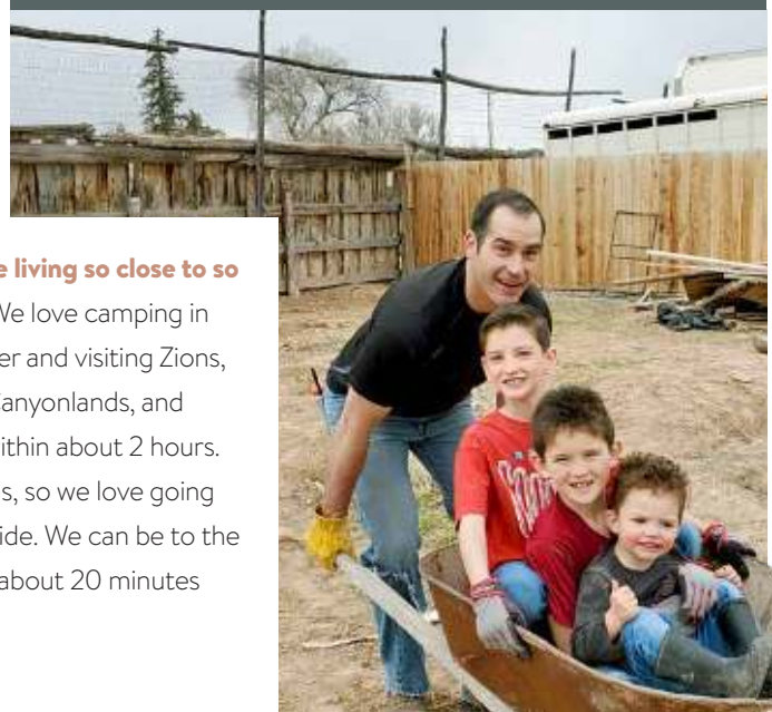
CLEANING UP THE BACKYARD

splash pad! We also love living so close to so many National Parks. We love camping in the Summer in our trailer and visiting Zions, Capitol Reef, Arches, Canyonlands, and Bryce Canyon, all are within about 2 hours. We live in the mountains, so we love going on rides in our side by side. We can be to the top of the mountain in about 20 minutes from our house!