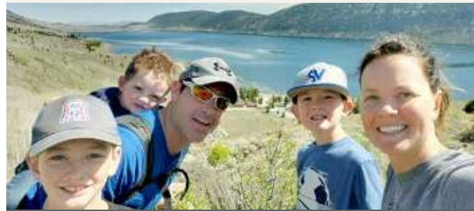
HIKING AT FISH LAKE