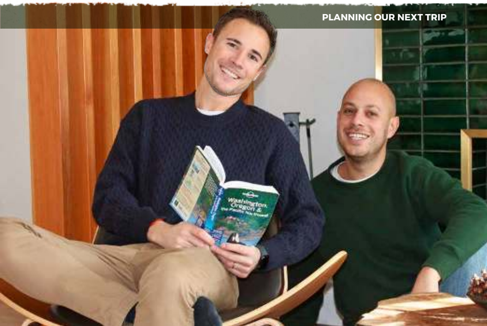
PLANNING OUR NEXT TRIP