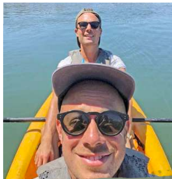
KAYAKING IN COSTA RICA