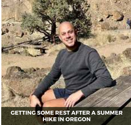
GETTING SOME REST AFTER A SUMMER HIKE IN OREGON