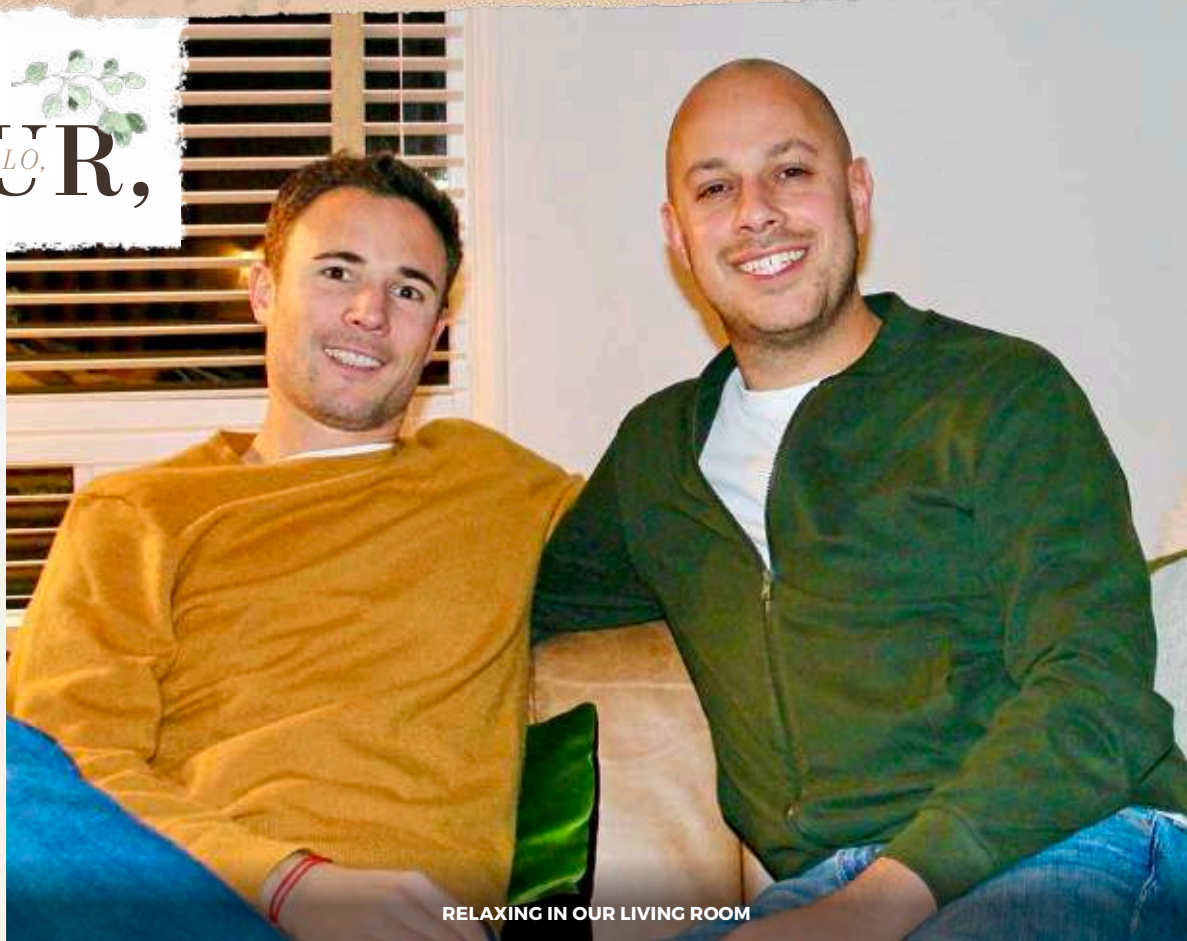
RELAXING IN OUR LIVING ROOM

Thanks for taking the time to learn about us, our story and our hopes for the future. We are from France originally but now live in Seattle, Washington.