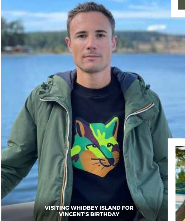
VISITING WHIDBEY ISLAND FOR VINCENT'S BIRTHDAY

running in the neighborhood, reading, planning our next vacation and boating.