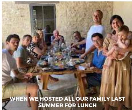
WHEN WE HOSTED ALL OUR FAMILY LAST SUMMER FOR LUNCH

WE CONSIDER OUR CLOSEST FRIENDS AS PART OF OUR EXTENDED FAMILY as the rest of our family lives 6,000 miles away! We see our friends a few times a week, to drop off food we have prepared, to play games or just hang out in the backyard.