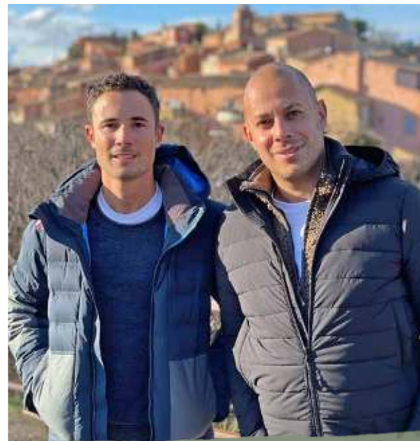
US LAST SUMMER VISITING PROVENCE