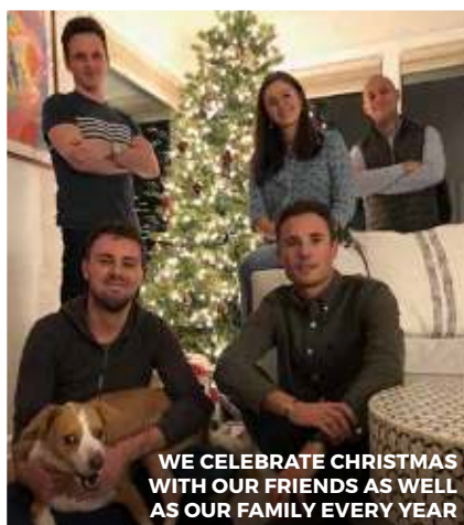
WE CELEBRATE CHRISTMAS WITH OUR FRIENDS AS WELL AS OUR FAMILY EVERY YEAR

WE CONSIDER OUR CLOSEST FRIENDS AS PART OF OUR EXTENDED FAMILY as the rest of our family lives 6,000 miles away! We see our friends a few times a week, to drop off food we have prepared, to play games or just hang out in the backyard.