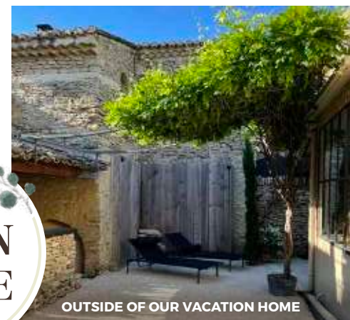
OUTSIDE OF OUR VACATION HOME