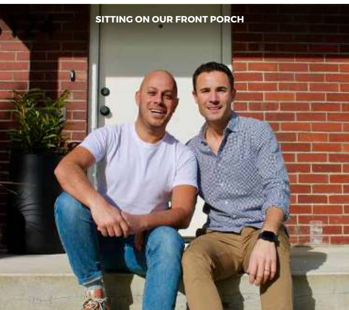
SITTING ON OUR FRONT PORCH

it our home. We live in a quiet, walkable and family-friendly neighborhood. The K-8 school is in front of our house and we can actually hear the bell from our living room! One of our favorite spots is our kitchen island because there is a window that overlooks our backyard. We sit there every morning to have breakfast.