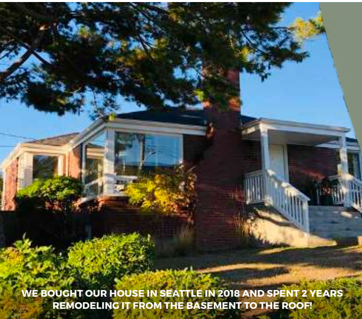
WE BOUGHT OUR HOUSE IN SEATTLE IN 2018 AND SPENT 2 YEARS REMODELING IT FROM THE BASEMENT TO THE ROOF!

MOVING TO SEATTLE WAS A BREATH OF FRESH AIR. ESCAPING THE DENSITY OF A BIG CITY PLAYED A MAJOR ROLE IN OUR DECISION TO LEAVE PARIS.