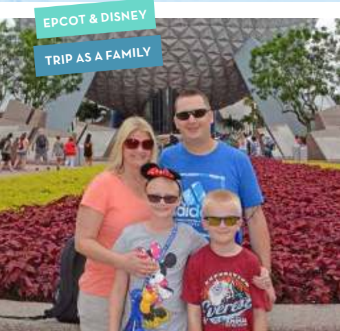
EPCOT & DISNEY TRIP AS A FAMILY

AS A FAMILY, WE ENJOY PLAYING GAMES TOGETHER, WATCHING SURVIVOR & THE VOICE AND SWIMMING IN OUR BACKYARD POOL.