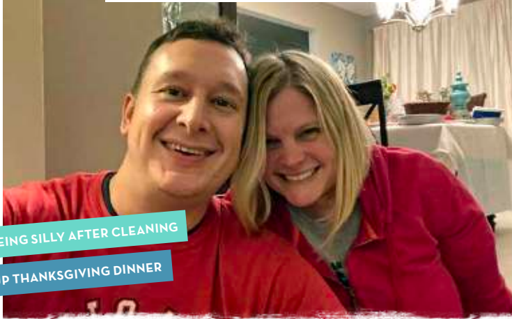
BEING SILLY AFTER CLEANING UP THANKSGIVING DINNER