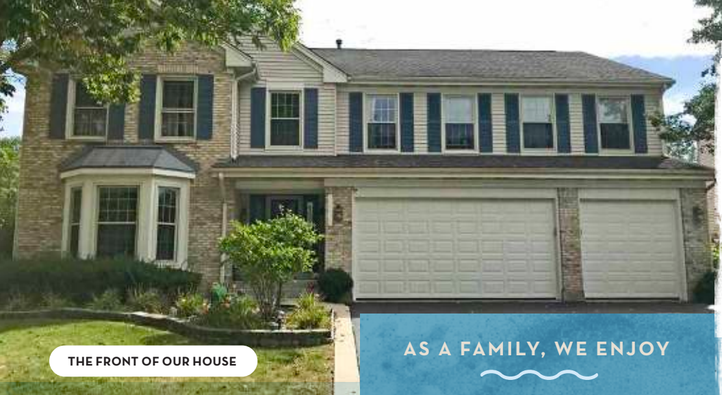
THE FRONT OF OUR HOUSE