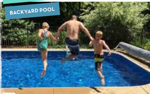
JUMPING IN THE BACKYARD POOL